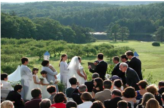
Ceremony on Terrace