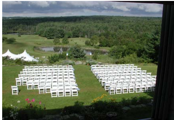
Aerial View of Terrace Setup for Ceremony