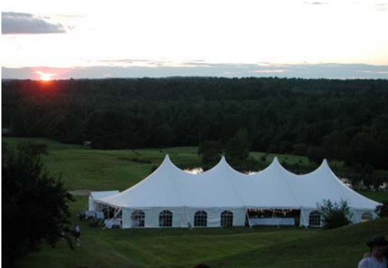
Reception in Meadow