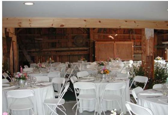
Partial View of Barn Reception Setup