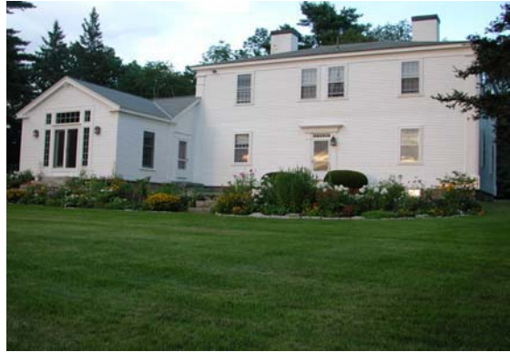
Rear Main House & Terrace