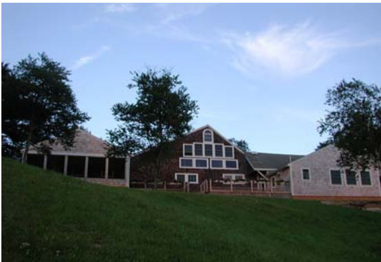
Rear View of Barn