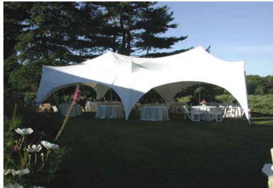
Small Tent for Reception on Terrace