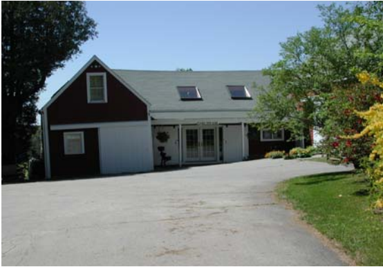
Welcome to Clark's Cove Farm