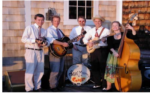
Jug Band on Deck