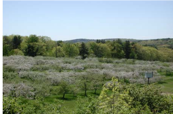
Orchard in Bloom